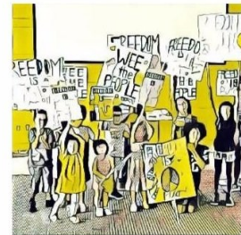
Wee The People little voices, big change