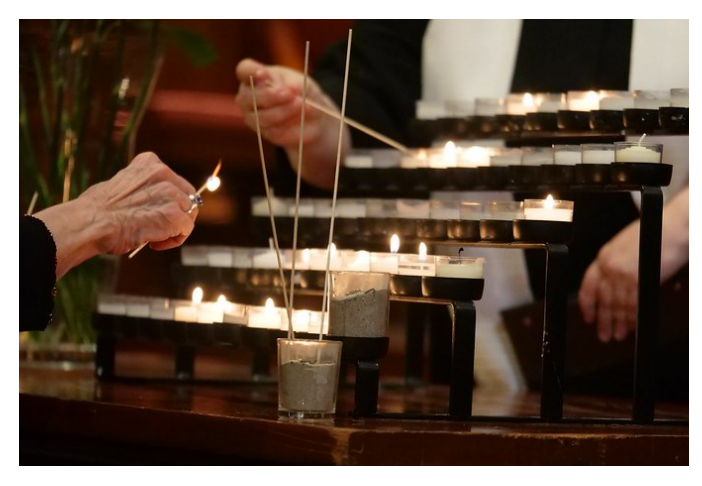
November 5th, 2023