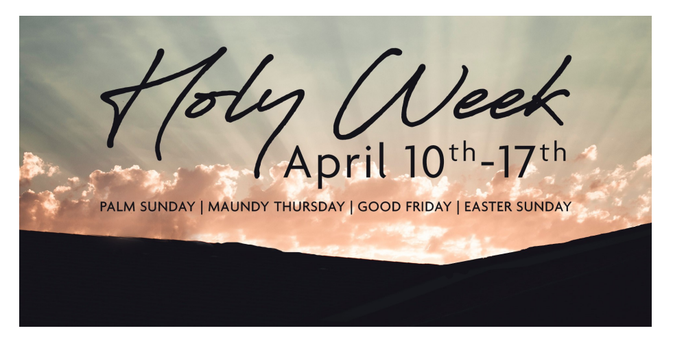
Our Holy Week services will be both in-person and streamed online.

PALM SUNDAY | APRIL 10 <sup>th</sup> | 9:00 a.m. and 11:00 a.m. We mark Jesus' triumphal entrance into Jerusalem as our shouts of Hosanna fade to the drama of the coming week.